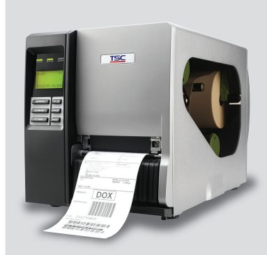
Value • Performance • Support